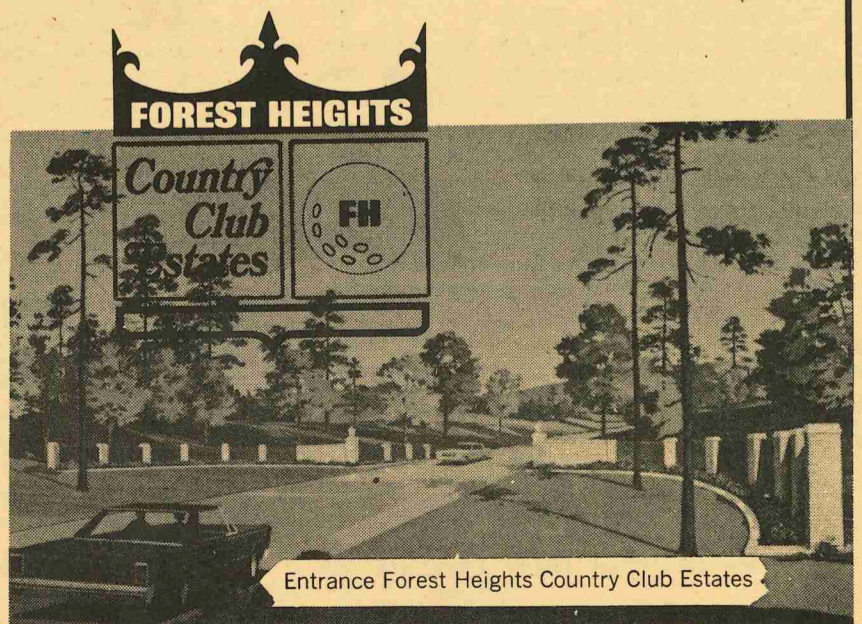
Entrance Forest Heights Country Club Estates